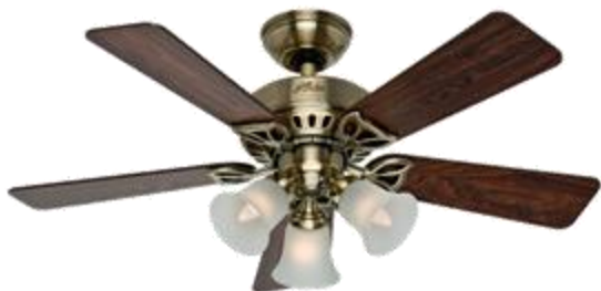
Model #: 24904 Housing Finish: Antique Brass Blade Finishes: Rosewood / Medium Oak