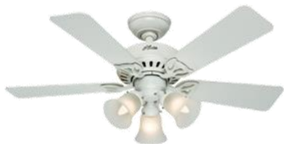
Model #: 24905 Housing Finish: White Blade Finishes: White / Light Oak