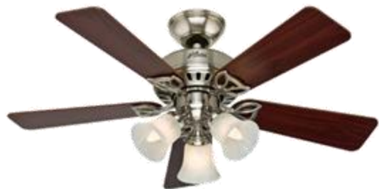
Model #: 24902 Housing Finish: Brushed Nickel Blade Finishes: Maple / Cherry